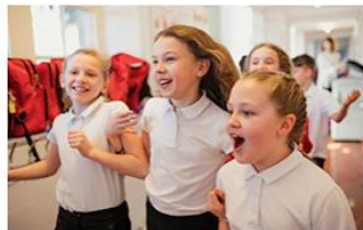
Catch-up: 4-16 year-olds