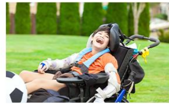
Support for SEND