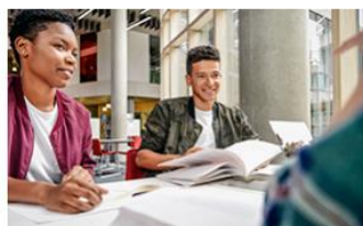
Catch-up: 16-19 year-olds